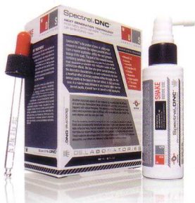
Spectral.DNC® NEXT GENERATION TECHNOLOGY FOR MEN WITH SEVERE THINNING OR SHEDDING HAIR