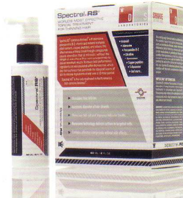
Spectral.RS® WORLD'S MOST EFFECTIVE TOPICAL TREATMENT FOR THINNING HAIR