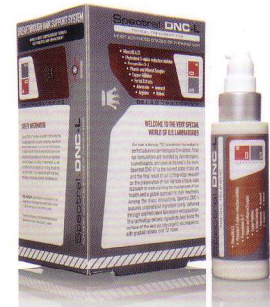
Spectral.DNC-L® TOPICAL TREATMENT FOR MOST ADVANCED STAGES OF THINNING HAIR