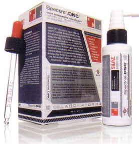
Spectral.DNC® NEXT GENERATION TECHNOLOGY FOR MEN WITH SEVERE THINNING OR SHEDDING HAIR